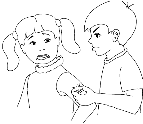
Fig. 2. Example line drawing from Odawa Production Experiment.

paid $20 Canadian for their participation. The experiment lasted an average of 45 min. Experimental sessions took place in a variety of locations, including the homes of the participants as well as in a community center.